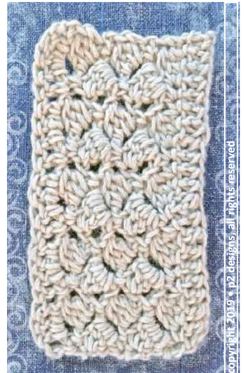
copyright 2019 • p2 designs, all rights reserved

TERMS OF USE ... This is a pattern for charity or personal use only - neither it, nor items made from it, are to be sold!