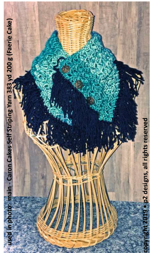
used in photo: main - Caron Cakes Self Striping Yarn 383 yd 200 g (Faerie Cake)