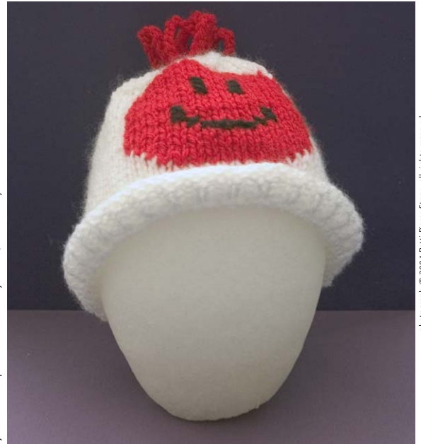
yarn used in photo: bernat baby softee, dreambaby dk for contrast