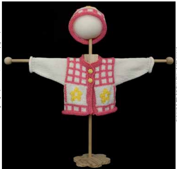
Lion Brand Baby Soft MC: bubblegum (pink), CC: white, C1: buttercup (yellow) yarn used in picture: