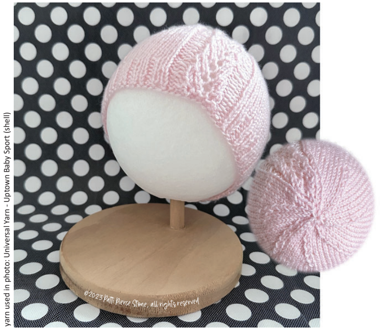
yarn used in photo: Universal Yarn - Uptown Baby Sport (shell)